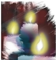
Hour of Tranquility