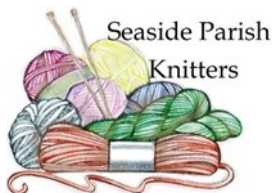
Seaside Parish Knitters