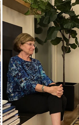
September Book Group